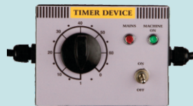
Mechanical Timer 1 to 60 minutes