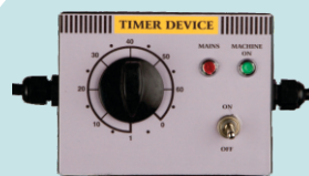
Mechanical Timer 1 to 60 minute