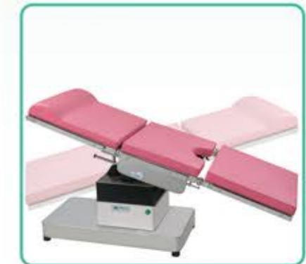
Trendelenburg / Rev. Trend.