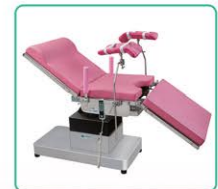
Back section adjustment